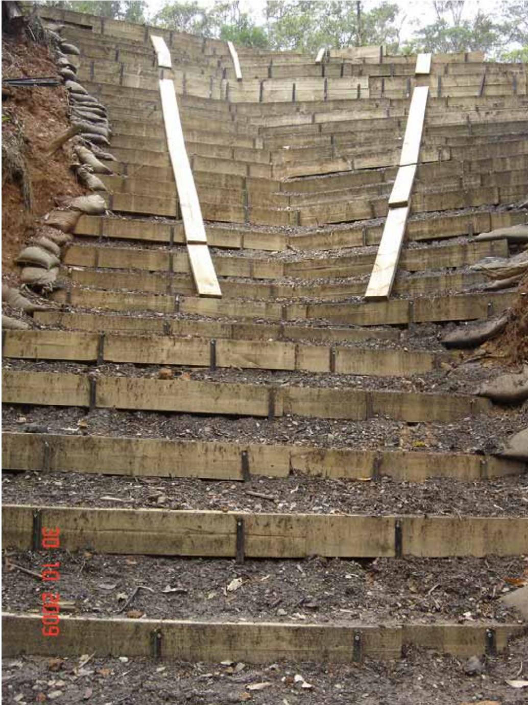
Installation of terraces with star pickets and treated pine boards