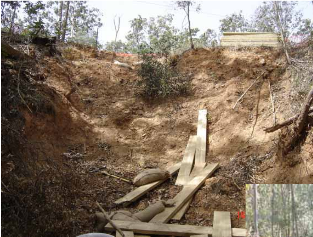
Landslide after heavy and prolong rain at Pullenvale, Brisbane, Australia